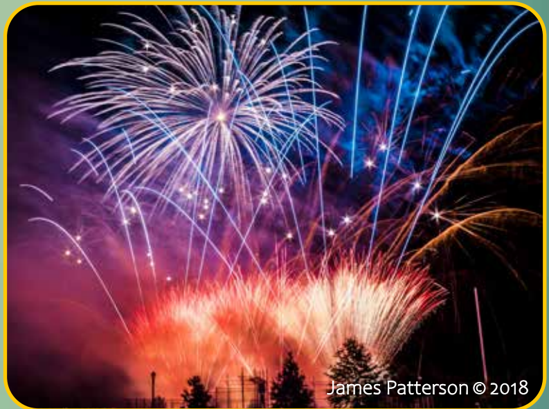
James Patterson © 2018